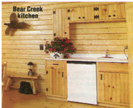
Bear Creek kitchen