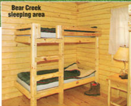
Bear Creek sleeping area

Check with local and state officials for zoning regulations and to get the proper building permits needed for any potential cabin site. Secure some means of getting electric, propane, water and sewer to the cabin site. The cabin will be shipped to the paved road nearest to the desired site. Moving it from there will be the customer's responsibility. The cabin will be shipped from Lebanon, Pa., in approximately six to eight weeks. Freight charges average approximately $1.95/mile. Call Cabela's Customer Service at 1-800-237-4444, ext. 113, for order and shipping information.